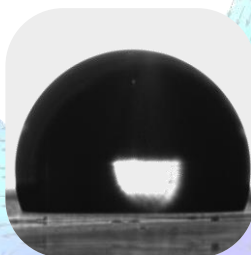
Wetting and spreading dynamics